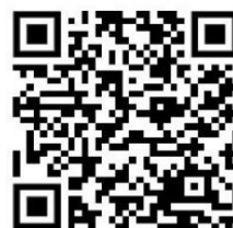
Buy Jesse Tree