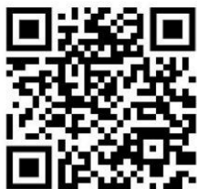
How to Advent

Give yourself the rest God planned for you and refocus Advent back to Jesus.