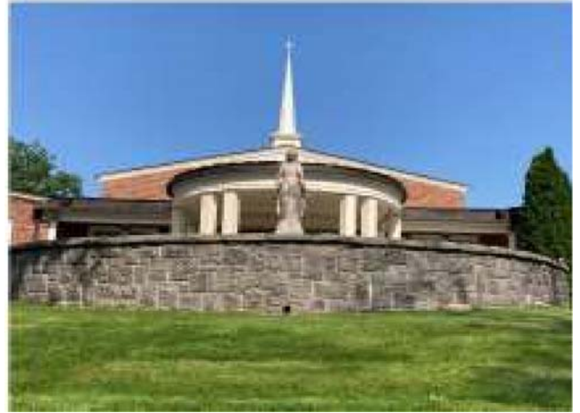
Upper Church and Parish Center