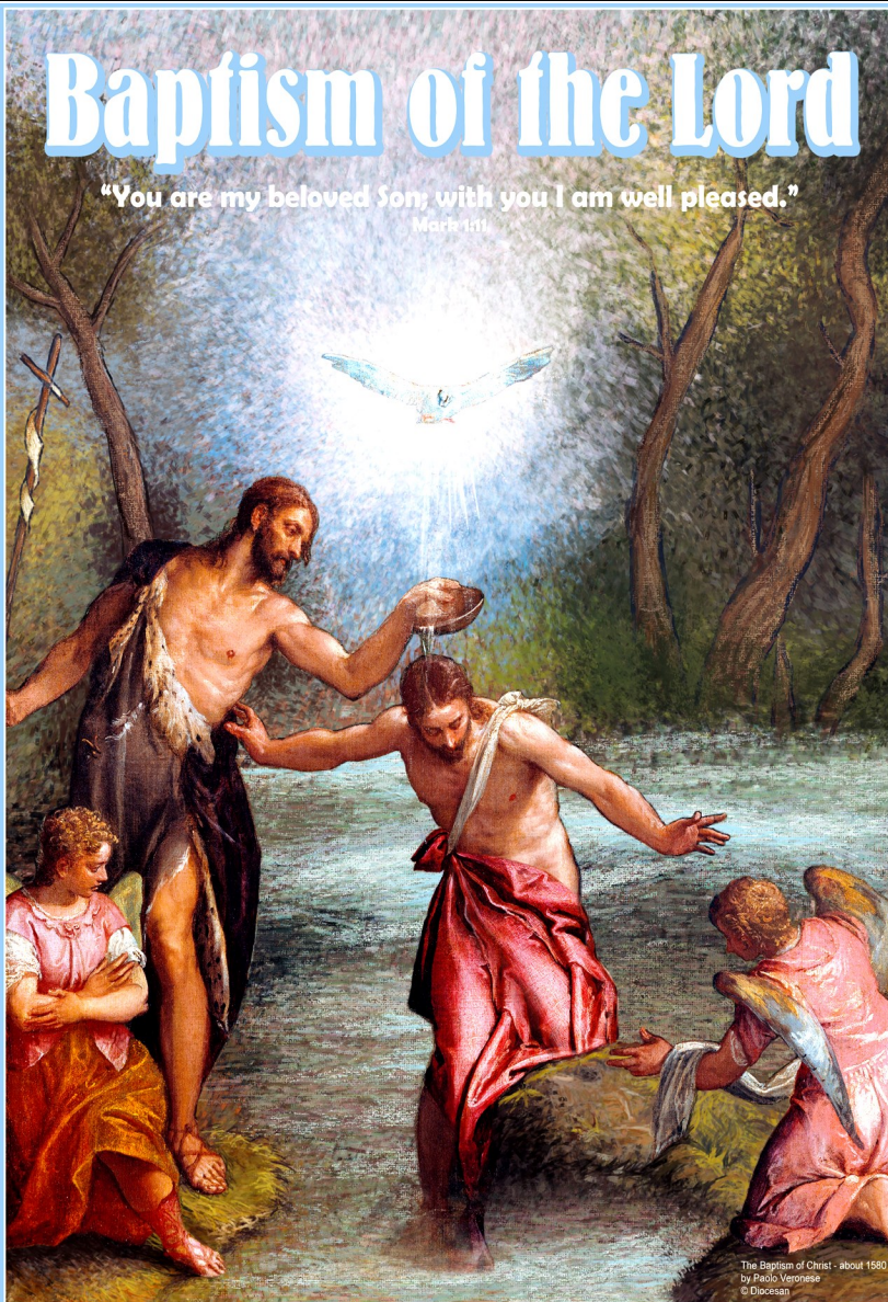
The Baptism of Christ - about 1590 by Paolo Veronese