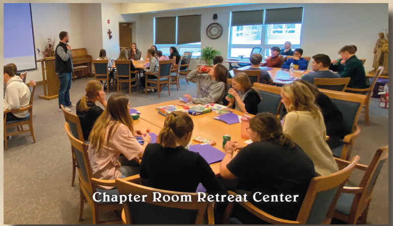
Chapter Room Retreat Center