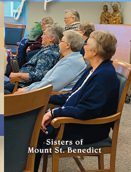
Sisters of Mount St. Benedict