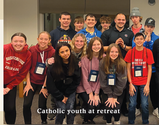
Catholic youth at retreat