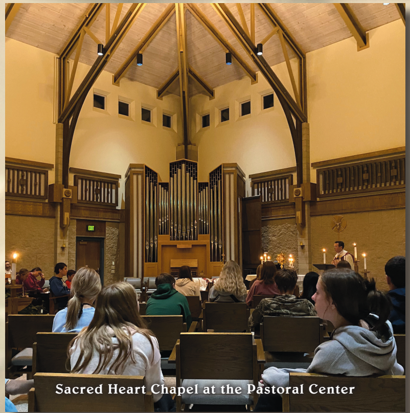
Sacred Heart Chapel at the Pastoral Center