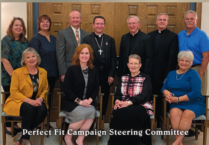
Perfect Fit Campaign Steering Committee