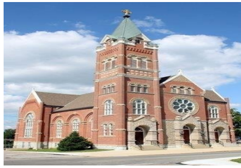
St. Mary Church 1115 Pearl St. Anderson, IN 46016 765-644-8467