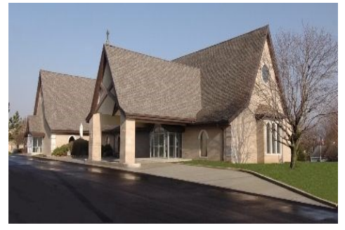
St. Mary Church 820 W. Madison St. Alexandria, IN 46001 765-724-4459