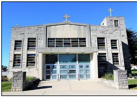
St. Ambrose Church 2801 Lincoln St. Anderson, IN 46016 765-644-5956