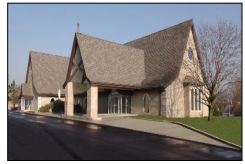
St. Mary Church 820 W. Madison St. Alexandria, IN 46001 765-724-4459