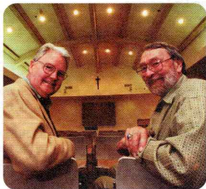
A candidate and his sponsor sit for a photo after an Order of Christian Initiation for Adults (OCIA) class.

I am happy you have responded to the stirrings of the Holy Spirit within you and answered the call to deepen your spiritual practice and journey. The Church needs you. The people of God welcome you. You are beloved among us, and your response in faith is a powerful witness, a reminder to those who may be tempted to take for granted the gift of faith. Thank you. ●