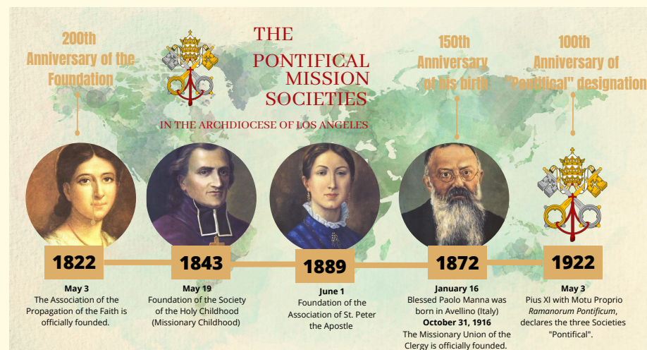
Timeline of the Pontifical Mission Societies and anniversaries for 2022

When we speak of mission, we have to remember that we are not sent on mission alone. When Christ gave his disciples the mission of evangelization, he told them the Holy Spirit would be sent to give them strength and power.