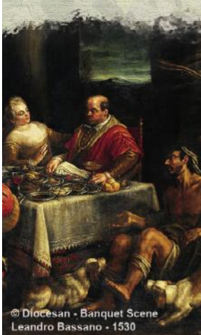
© Diocesan - Banquet Scene Leandro Bassano - 1530