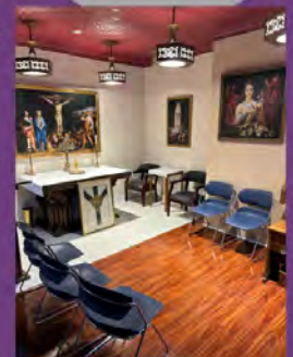
Pictured above is the first completed project: The Chapel