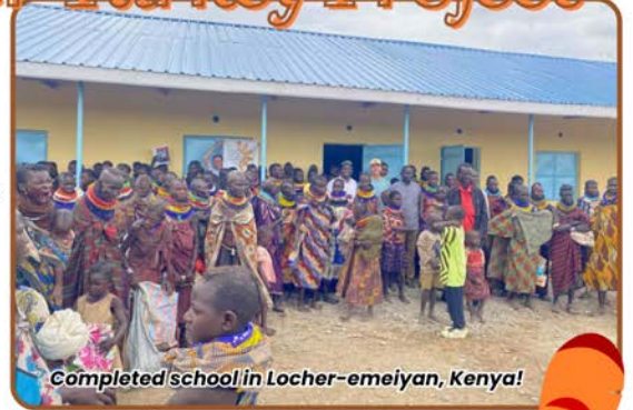
Completed school in Locher-emeiyan, Kenya!

PENCILS, WORKBOOKS, WALL CHARTS, ETC. ($5/CHILD PER TERM)