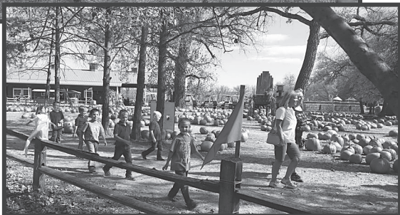
Students in preschool through first grade went on their annual trip to Papa's Pumpkin Patch in September.