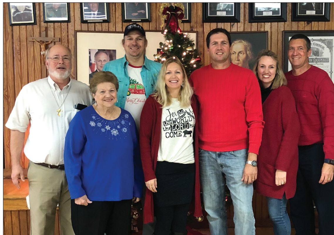
Society #29 held their last meeting of 2021 and their Christmas party on December 12. The Christmas party was celebrated with members of Society #29 KJZT. Fried chicken, many delicious sides and dessert were enjoyed by everyone.