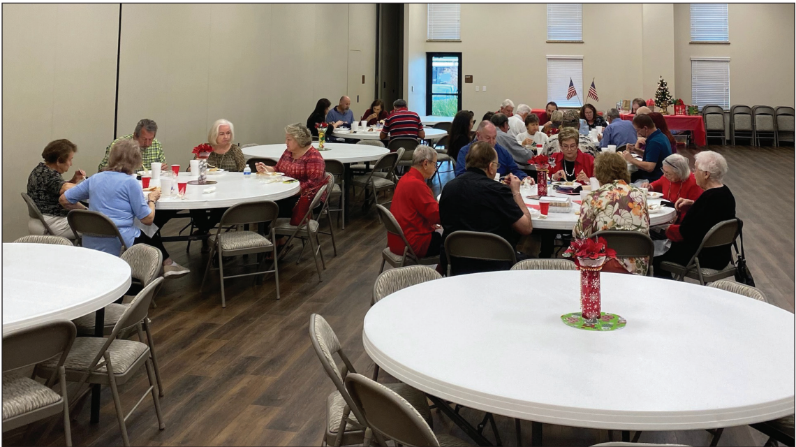
Everyone had a great time at the annual KJT Society #121 Christmas party/meeting on December 05,2021 at St. Jerome Activity Center. Thanks to all who helped with organizing this event. Joining us were KJT Society #56, KJZT Societies #114 and #32.