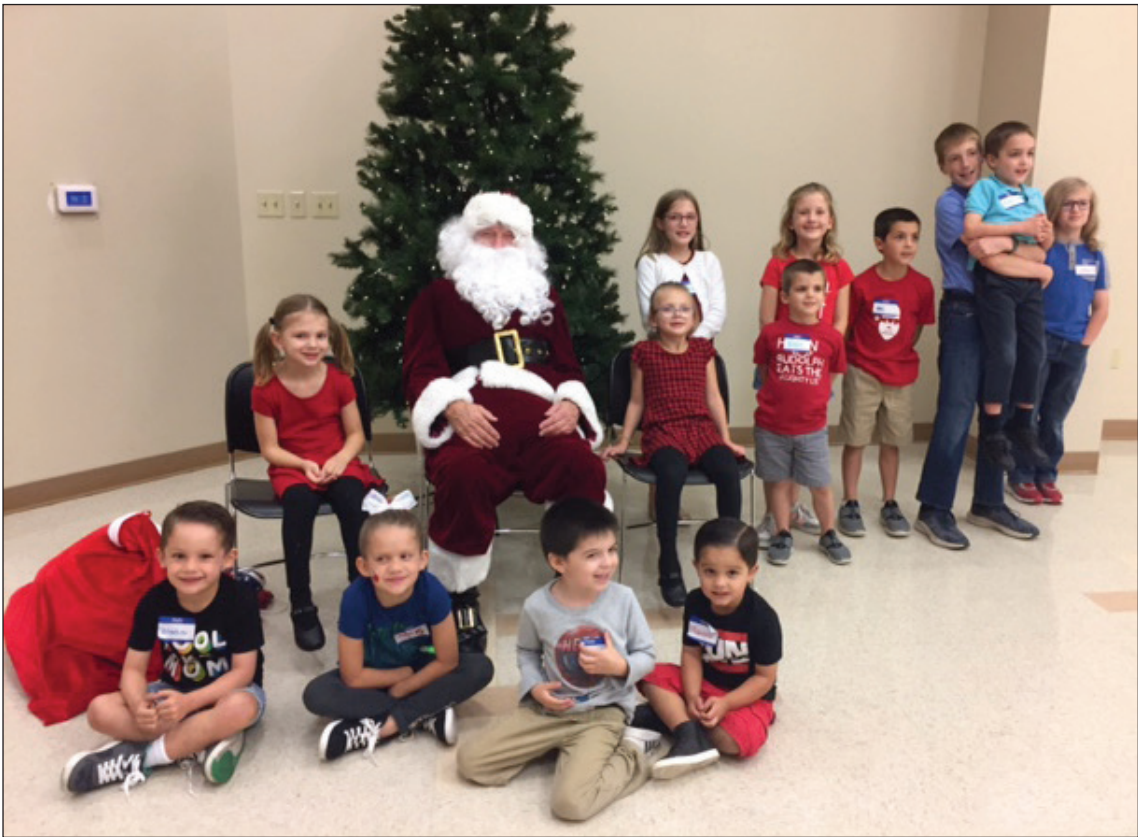
Santa came to visit the children at the St. William KJT #134 Round Rock Christmas Dinner/Meeting on December 4, 2021.