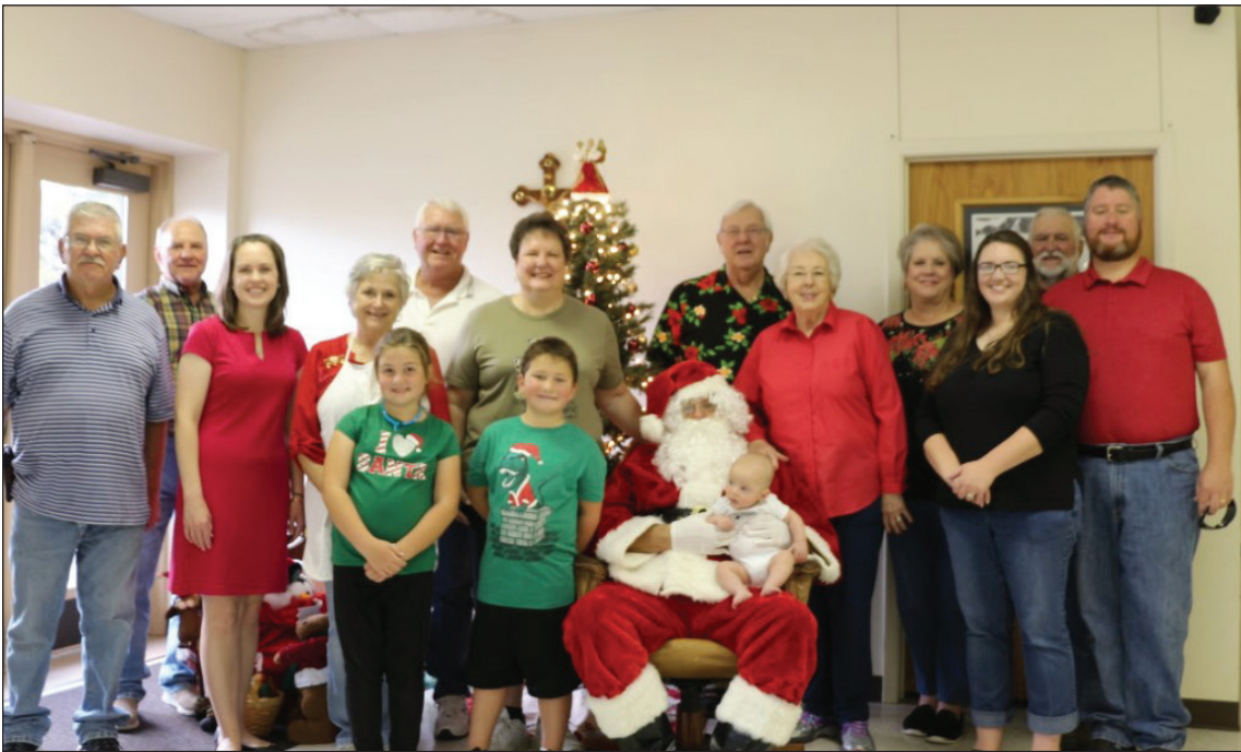
St. Benedict KJT Society 100 (Caldwell) held their 2021 Breakfast With Santa fundraiser and bake sale which was held in the St. Mary's PAC on Saturday, December 4, 2021. Pictured are all of the KJT #100 Society members who worked and attended this annual event with Santa.