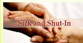
Sick and Shut-In

Are you currently bringing the Eucharist to someone who can't attend Mass? Our parish would like to send you to our absent