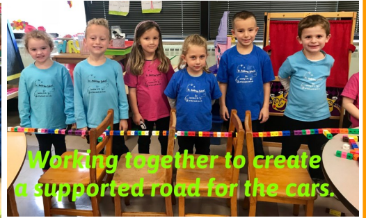
Working together to create a supported road for the cars.