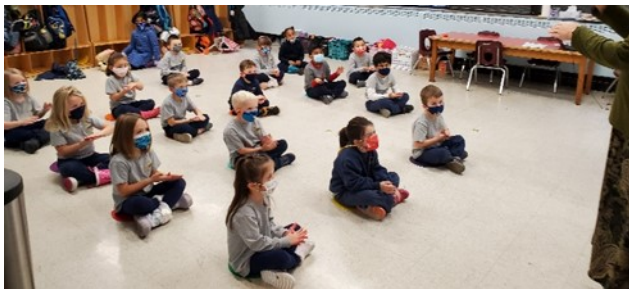
Kindergarten is learning Silent Night In Sign Language.

Students are also preparing for their annual Christmas Show. This year we are performing the Twelve Days of Christmas. It is a story explaining that “our true love” is God. The first day represents One Bible, Two Testaments, Trinity, Four Gospels, Pentateuch, Six days of Creation, Seventh day of rest, Eight Beatitudes, Nine fruits of the Holy Spirit, Ten Commandments, Eleven true Apostles, and the Twelve Tribes of Israel.