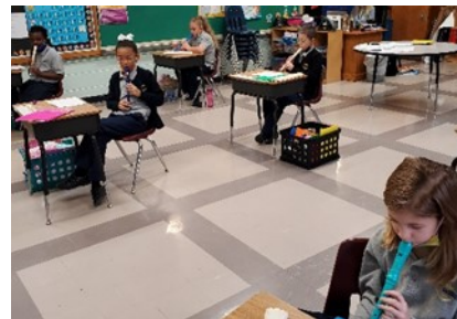
Grade 3 is learning Jingle Bells on their recorders.

Have a Blessed and Joyous Season of Advent. Merry Christmas!