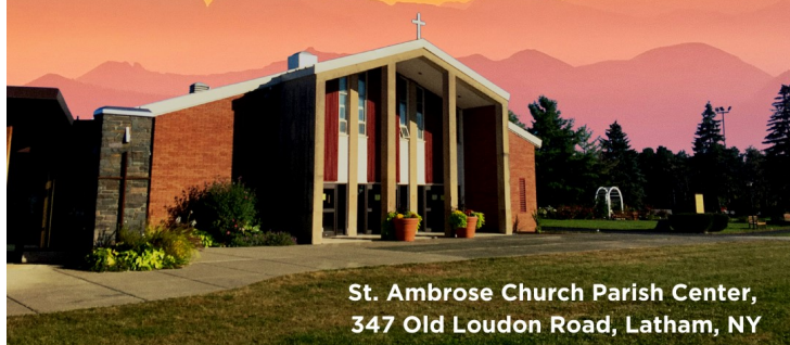
St. Ambrose Church Parish Center, 347 Old Loudon Road, Latham, NY

Please join us as we welcome the Bishop for a special listening session for the LGBTQ community. Come voice your questions, concerns, and recommendations.