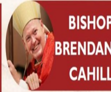
BISHOP BRENDAN CAHILL