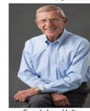
Coach Lou Holtz KEYNOTE