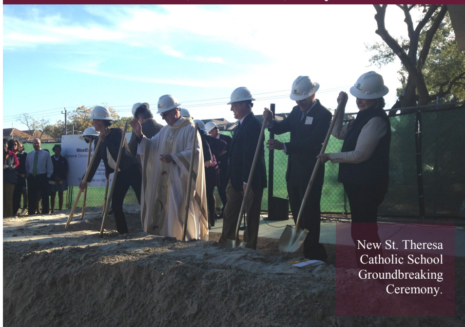
New St. Theresa Catholic School Groundbreaking Ceremony.