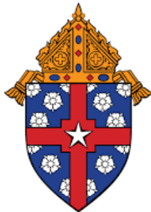
THE ARCHDIOCESE OF GALVESTON-HOUSTON

If you'd like to join our prayer chain and pray for others, please click here.