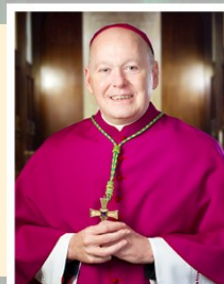
BISHOP BRENDAN CAHILL