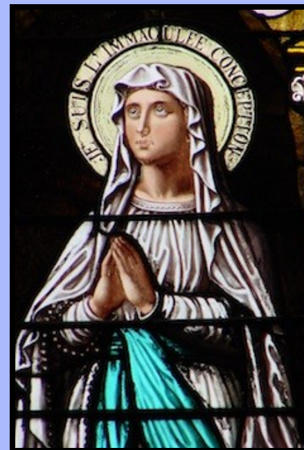
Mary of the Immaculate Conception Patron of our Diocese