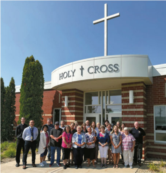
Holy Cross teachers and staff were excited to welcome students and families back to school this week.