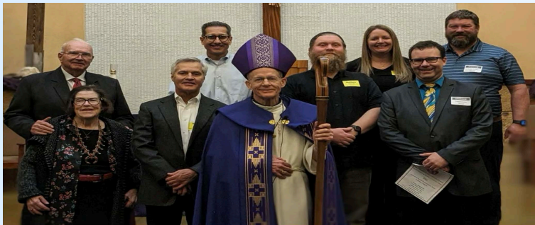
Prince of Peace catechumen and candidates at the Rite of Election.