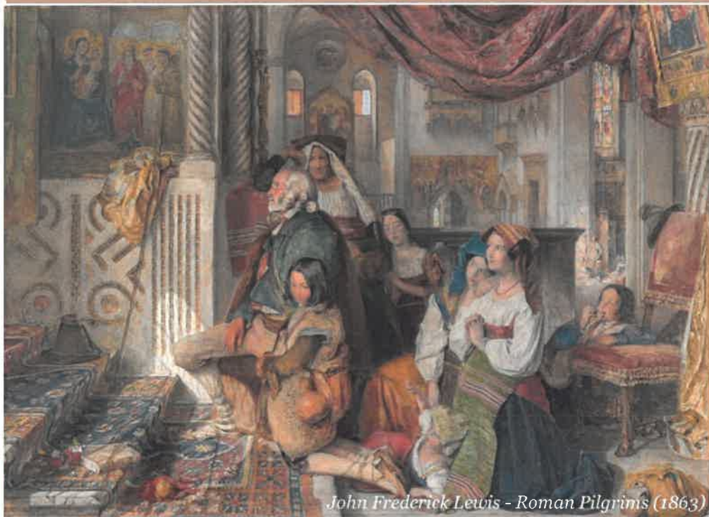
John Frederick Lewis - Roman Pilgrims (1863)