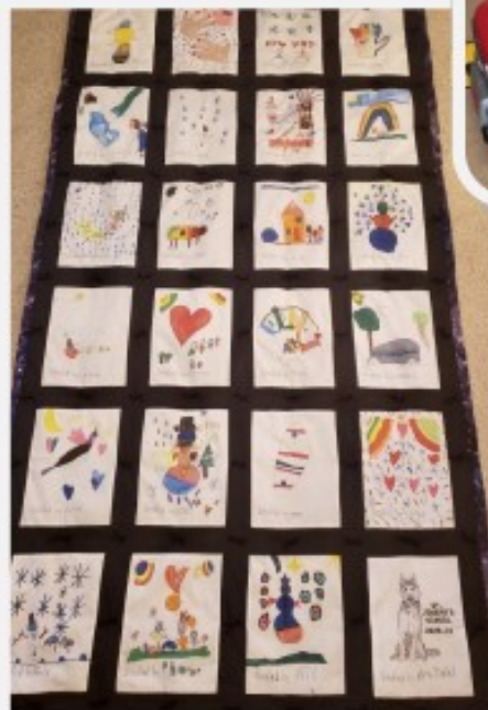
St. Joseph's 1st Grade Quilt. Each panel has been designed by one of our very own 1st graders! 42"x78"