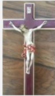
Hand carved and painted crucifix