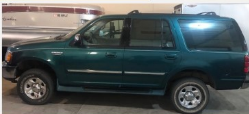
1997 Ford Expedition