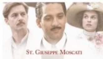
ST. GIUSEPPE MOSCATI

Giuseppe Moscati, "the holy physician of Naples," as a medical doctor and layman in the early twentieth century who came from an aristocratic family and devoted his medical career to serving the poor. His research also led to the discovery of insulin as a cure for diabetes. Moscati regarded his medical practice as a lay apostolate, a ministry to his suffering fellowmen. Before examining a patient or engaging in research, he would place himself in the presence of God. He encouraged his patients to receive the sacraments.