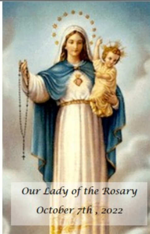
Our Lady of the Rosary October 7th, 2022

"You are the hope of the Church and of the world. You are my hope."