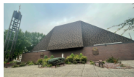
Church of St. Joseph - Williston Parish