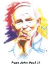
Pope John Paul II