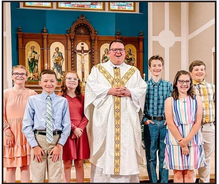
St. Mary School 2023 Sixth Grade Graduates.