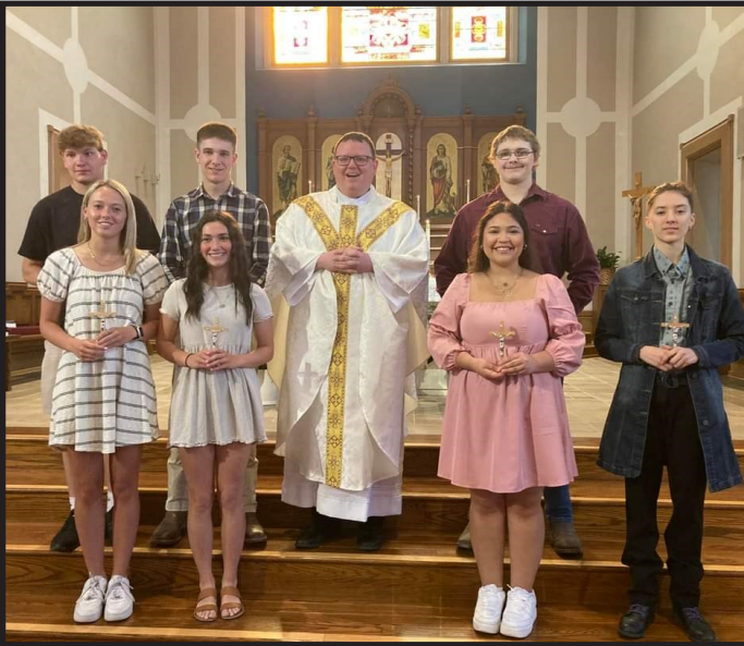
St. Mary Church 2023 Graduating Seniors.

512 North Perkins Street ✕ Rushville ✕ Indiana ✕ 46173 Parish: 765-932-2588 ✕ School: 765-932-3639 ✕ www.stmaryrush.org