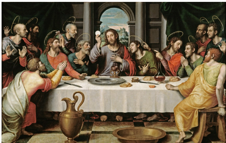
Vicente Juan Masip c. 1560