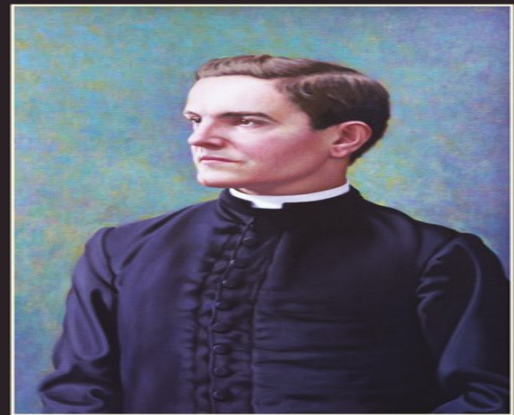
Blessed Michael J. McGivney 1852 - 1890 Founder of the Knights of Columbus Beatified 31 October 2020