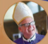
BISHOP DONALD HYING