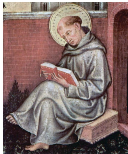
DETAIL (THOMAS AQUINAS) FROM VALLE ROMITA POLYPYCH BY GENTILE DA FABRIANO (CIRCA 1400) WIKIPEDIA