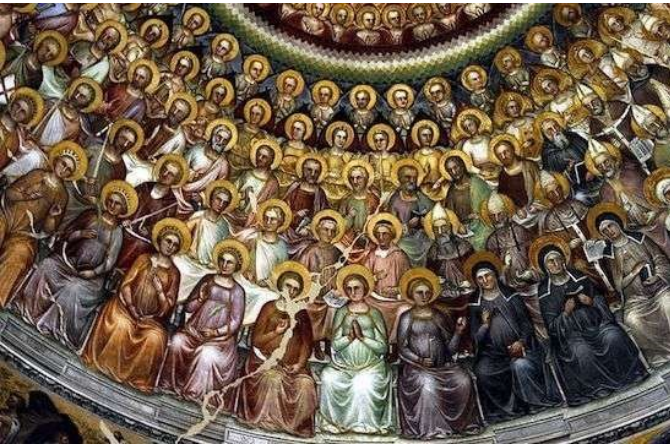
November Reminds Us of the Communion of Saints.

Praying for the Dead: We pray for the dead because we believe death's not the end. As Christians, we don't see death as the end of this mutual duty and charity. We understand that in Jesus Christ, death has no power over the unity of all believers and the power we have to pray and intercede for one another.