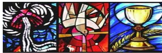
OFFER, STRENGTHEN, SUSTAIN

As parents and guardians you are the number one influence on your child's faith. What you do to nurture faith and love for God at home and at the parish are vitally important. You are not alone in your responsibility. Your faith community at Sts. Peter and Paul Church is here to support you and thrilled to be sharing in this exciting time of your child's faith journey. A journey that began at Baptism will continue through the Sacraments of Reconciliation, Confirmation, and First Eucharist.