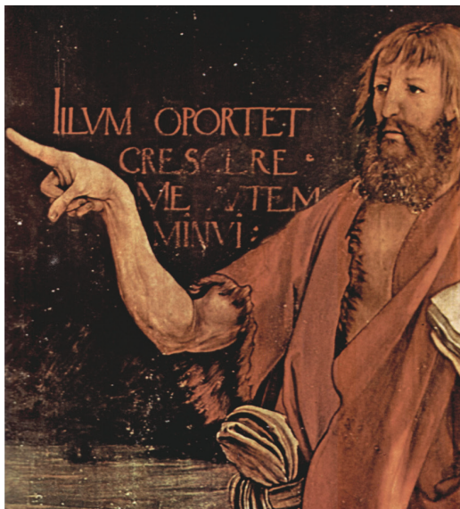
NIKOLAUS OF HAGUENAU AND MATTHIAS GRÜNEWALD: JOHN THE BAPTIST DETAIL OF THE ISENHEIM ALTAPIECE