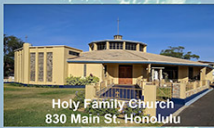
Holy Family Church 830 Main St. Honolulu