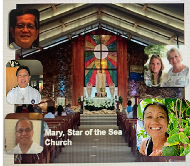
Mary, Star of the Sea Church

Please Celebrate with us at the 'OHANA MASS Saturday, August 23 at 5:30pm at Mary, Star of the Sea Catholic Parish Church