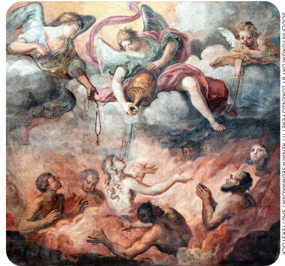
SOULS IN PURGATORY BY LORENZO PERETTI