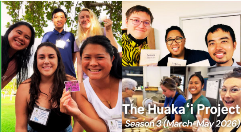
The Huaka'i Project Season 3 (March-May 2026)