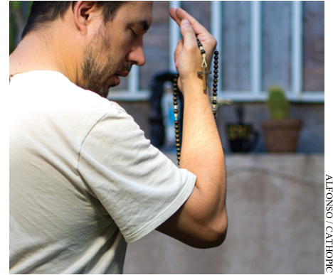
ATHANASO / CATHOLIC