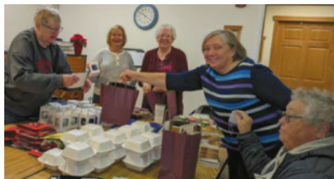
Filling the Sunshine Bags

We thank the many parishioners who have assisted in many ways to help St. Ann and Our Lady share God's message of love and mercy to others. During this Advent Season, volunteers stuffed and mailed the Christmas letters, put up the Social Hall tree at Our Lady, held a collaborative Christmas party and filled/ delivered "Sunshine Bags" that contained activities and "goodies" to share with our parishioners who cannot make it to Mass. We thank the anonymous donor who purchased a 100-year ornament for each of these recipients and the Religious Education students for making all of the beautiful cards. When we all work together, we can accomplish many great things and bring God's love to all! May everyone feel the love of Christ this holy season!