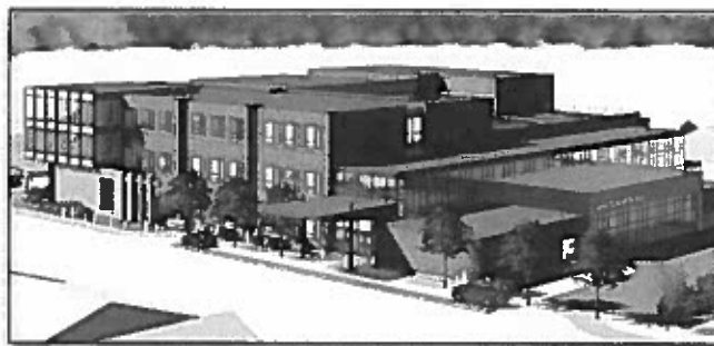
SPECIAL TO THE COMPASS

The new school will merge the two campuses into a three-story 87,000-square-foot, state-of-the-art building, serving students from early childhood through eighth