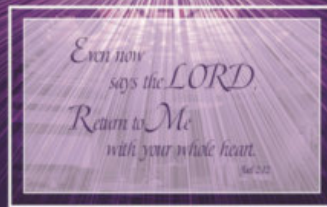
Lent and Easter Schedule