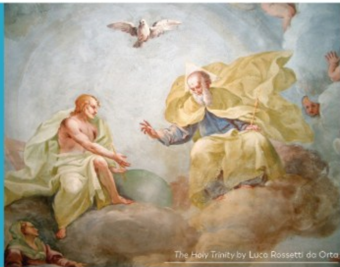
The Holy Trinity by Luca Rossetti do Orta

T he Sign of the Cross, a simple gesture that begins and ends many of our prayers, is deeply rooted in Scripture and carries rich spiritual significance.