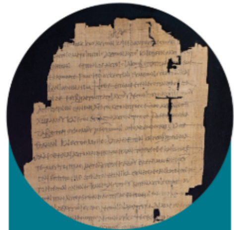
Papyrus with fragments of the Book of Genesis