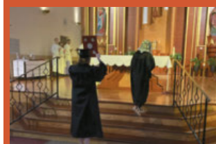
Photo from the Spring 2023 Baccalaureate Mass.

Fifth Sunday of Easter | Quinto Domingo de Pascua | Year A