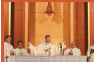
Photo from St. Peter's Basilica.

August 27, 2023 | 27 de Agosto de 2023 Twenty-first Sunday in Ordinary Time | XXI Domingo Ordinario | Year A