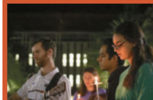
Photo from the 2017 UAA Thanksgiving Food Drive.

Twenty-third Sunday in Ordinary Time | XXIII Domingo Ordinario | Year A